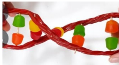
Food Based Model