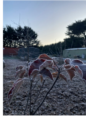
Winter this week at Sacred Heart College