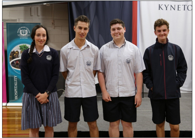
Nightingale House Captains