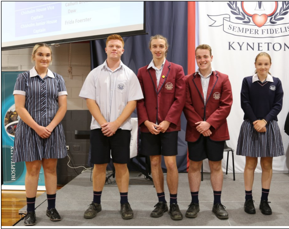
Chisholm House Captains