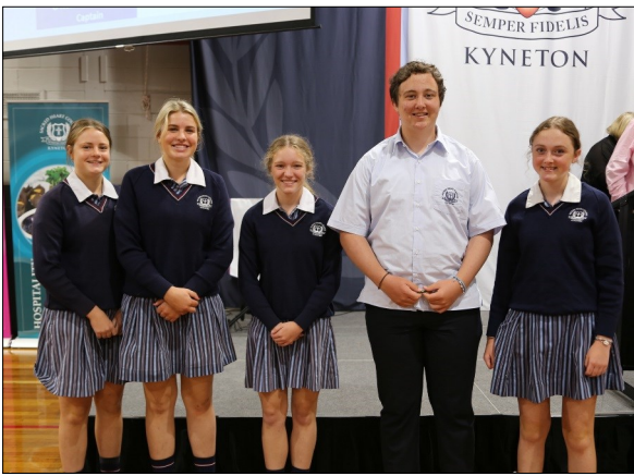
O'Neill House Captains