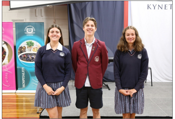
McAuley House Captains